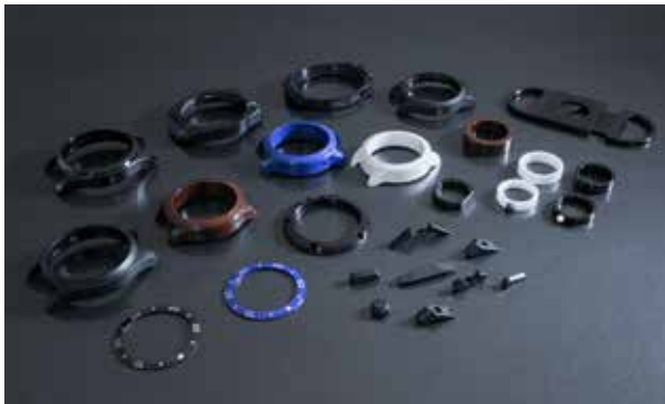
Watch industry and jewelry

Dental zirconia blanks made by Micro Ceram are used to produce copings, bridges and abutments.