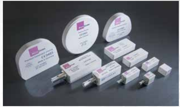
Zirconia blanks for dental milling

In medical technology ceramics are characterized by a high biocompatibility. Ceramics are also resistant against body fluids.