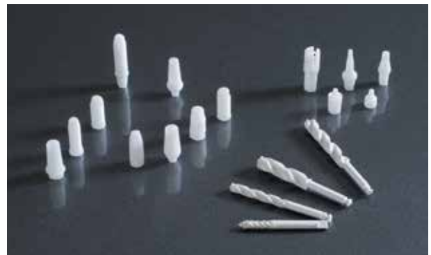
Components for dental technology

A luxurious look and an extremely high scratch resistance as they are provided by technical ceramics are qualities being strongly in demand for watch components as well as for chain links, bezels, rings and pendants.