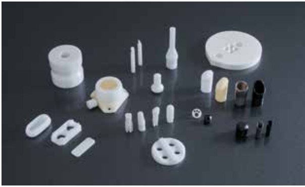
Components for medical technology

In medical technology ceramics are characterized by a high biocompatibility. Ceramics are also resistant against body fluids.